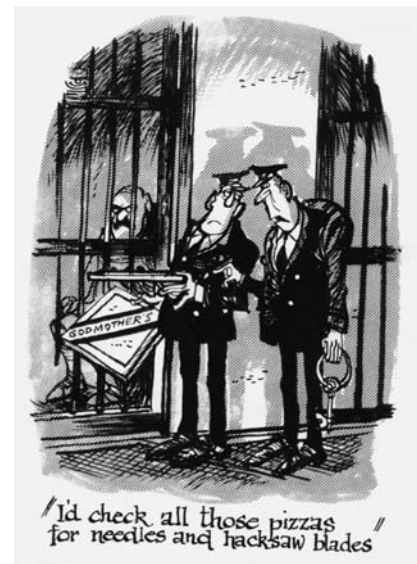
Cartoon from the NY Post

The investigation developed evidence of money laundering by members of the conspiracy. Between 1980 and 1988, over $60 million in used $5, $10 and $20 dollar bills were smuggled or transferred by various channels from New York to Switzerland, Italy and Turkey. Cash was sent out of the U.S. by cash transfers, wire transfers and through brokerage accounts established at EF Hutton and Merrill Lynch to business fronts operated by mafia members overseas. Several cash transfers were made by Swiss Airways by placing Samsonite suitcases full of cash with the Swiss Air station manager. Between July and December of 1980, one metric ton of cash was sent out of the United States. $17.5 million of this was sent to pay the Turkish supplier of morphine base for his part in providing the network with 3,900 pounds of morphine base. Based on the prices of the day, the retail value of the heroin sold in the U.S. at the time was estimated to be $4.8 billion.