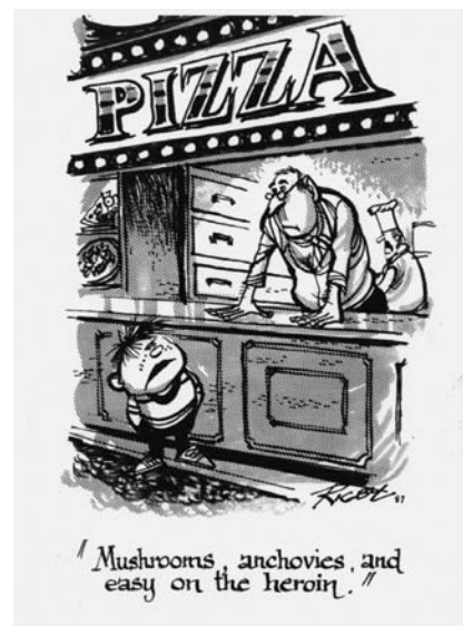
Cartoon from the NY Post

The trial commenced on September 30, 1985 and was held in the large ceremonial courtroom at the Foley Square Courthouse. Two full juries were empaneled to hear the evidence. Hours of intercepted conversations from 93 Title