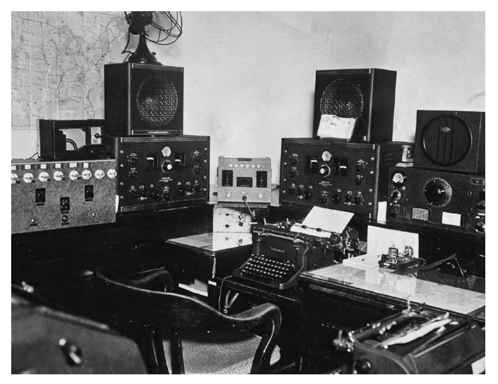
Honolulu FBI Radio Gun Vault July 1942

frequency radio with strategic field offices, particularly Juneau, AL; San Juan, PR; and Honolulu.