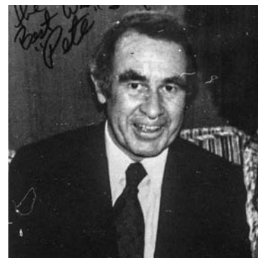
Senator Harrison Williams