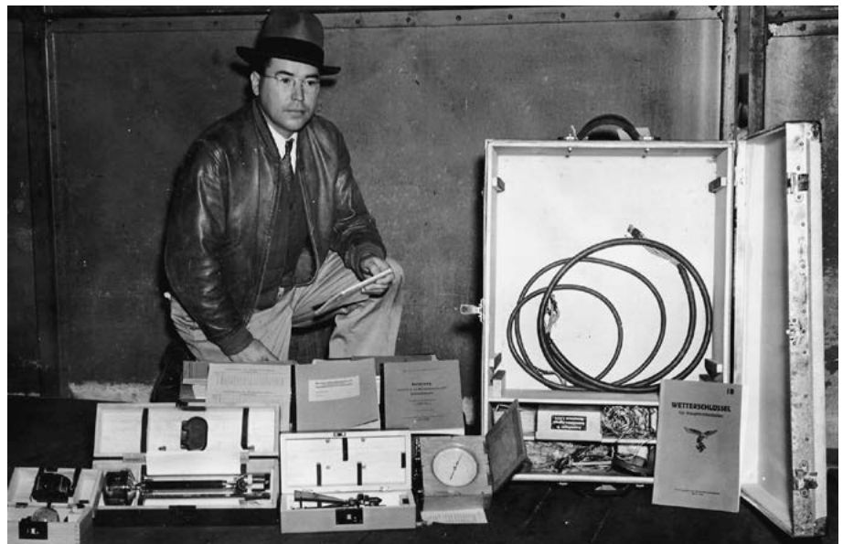
Unidentified Agent with the contents of the cases which were found buried under 200 polar bear skins — a complete meteorology station