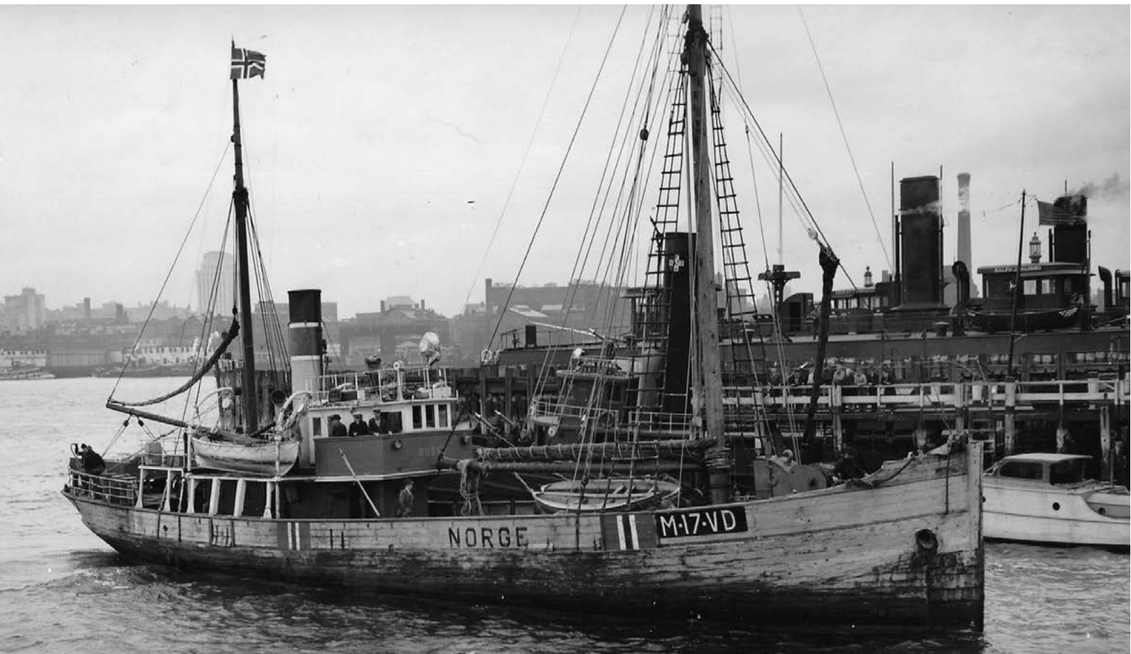
The ship Busko

Germany hungered for weather data. Such information was vital for their naval activities in the eastern Atlantic, air operations over England and, since June 1941, her ground and air forces in Russia. As weather moves west to east, a seriously disadvantaged Germany had little choice but to venture into U.S. and British-controlled arctic waters to collect and report vital information on weather conditions that days later would drift over the British Isles and the European continent.